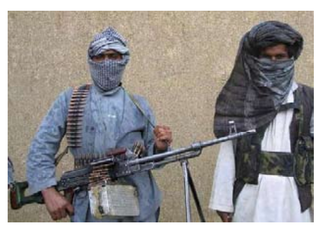
Taliban soldiers: The latest strategy - pay them to go home

The US campaign in Afghanistan was sold to the West as a championing of human rights, and particularly of women's rights. Yet conditions for women are virtually unchanged. Recently, the Karzai government passed a law allowing husbands to deprive their wives of food as punishment for refusing sex. Another recent law allowed "blood money" to