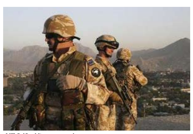
NZ SAS soldiers on patrol

The troops are being deployed in three rotations over 18 months and the full deployment involves 70 soldiers over that time period. At the same time, over that 18 months the NZ Army's Provincial Reconstruction Team – NZ's major commitment to the war – are being gradually reduced and eventually withdrawn, their work to be replaced by civilian work on agricul-