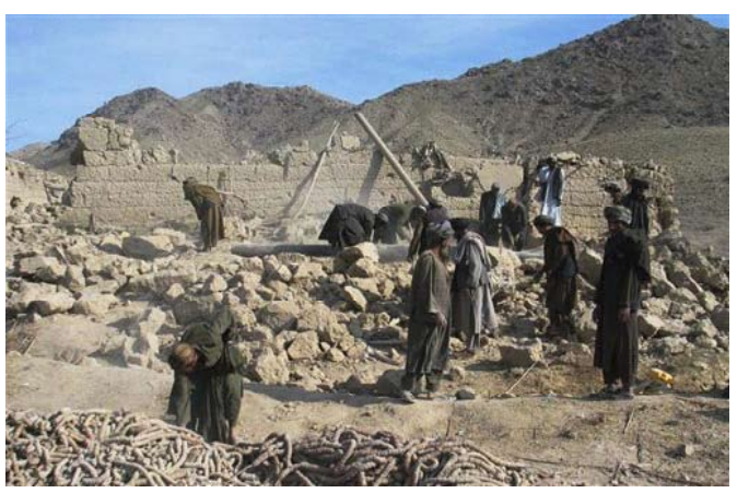
Afghan villagers picking over rubble: "Reconstruction" must seem a sick joke

Iraq, a population that feels it has nothing to lose by resisting Western intervention.