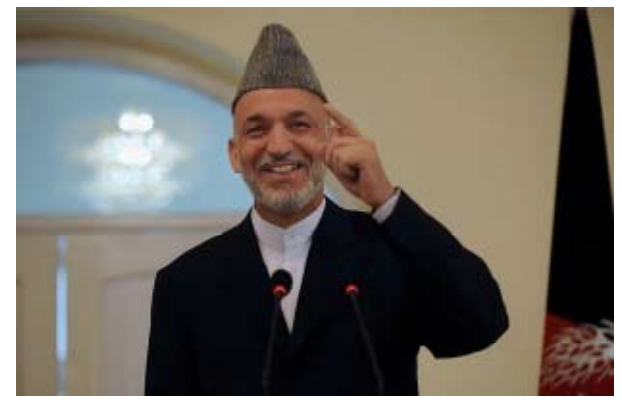
Hamid Karzai: "The Mayor of Kabul"

the slightest regard for the requirements of the local people, in this case the Pashtun tribes. The border ignored tribal and migratory factors and instead followed the line able to be most easily defended by troops in British India. This in large part explains the presence of strong support in parts of North West Pakistan for the Afghan resistance. The